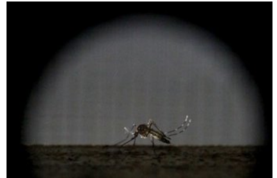
PHOTO: Aedes aegypti mosquito, one of two species known to spread the Zika virus.

"In another case, Zika virus was found in semen about two weeks after a man had symptoms with Zika virus infection, so that sort of gives you the biologic plausibility of spread."